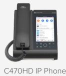
C470HD IP Phone