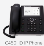
C450HD IP Phone