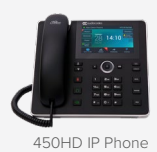
450HD IP Phone