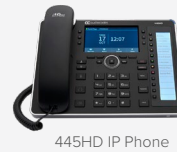
445HD IP Phone