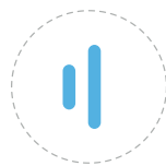
Meeting Productivity & Compliance Recording